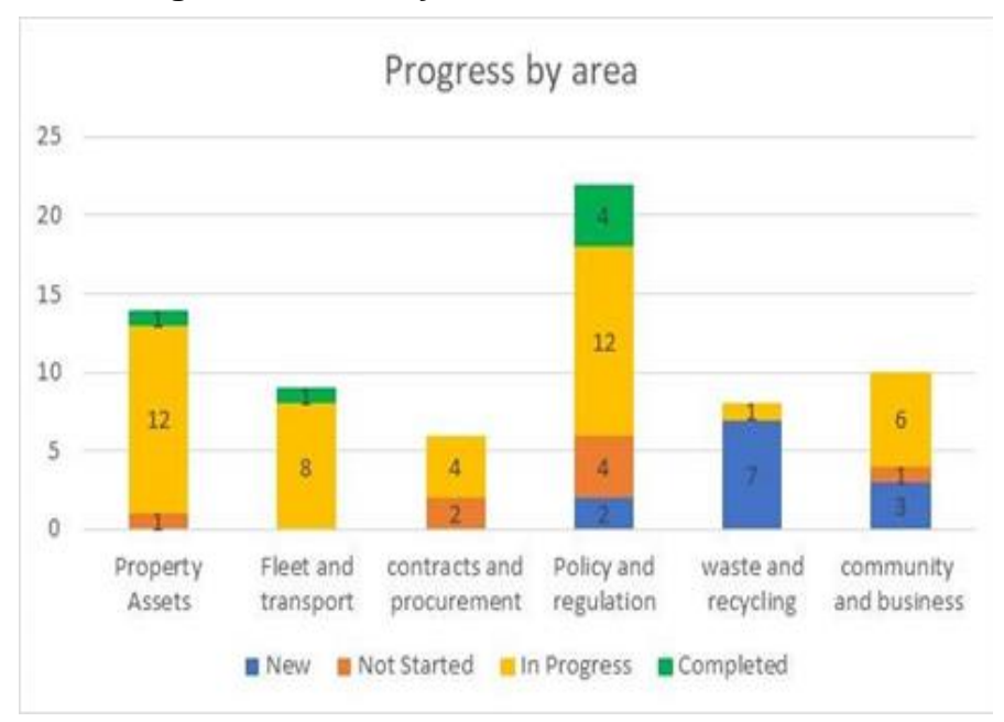
Table 1: Progress to date by theme

4.5. The plan is constantly evolving as research and technology develops; 9% of the actions are completed with over half actively in progress. If just over 11% of the original actions are completed annually, the plan will be completed in line with 2030 target. As work has begun on many of the actions, the target is achievable. Table 2 below shows the progress to date by theme.