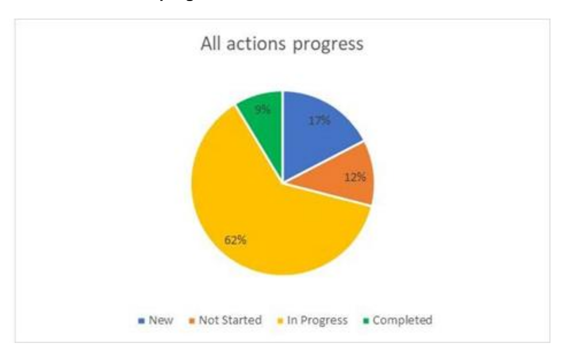
Table 2: All actions progress

4.5. The plan is constantly evolving as research and technology develops; 9% of the actions are completed with over half actively in progress. If just over 11% of the original actions are completed annually, the plan will be completed in line with 2030 target. As work has begun on many of the actions, the target is achievable. Table 2 below shows the progress to date by theme.